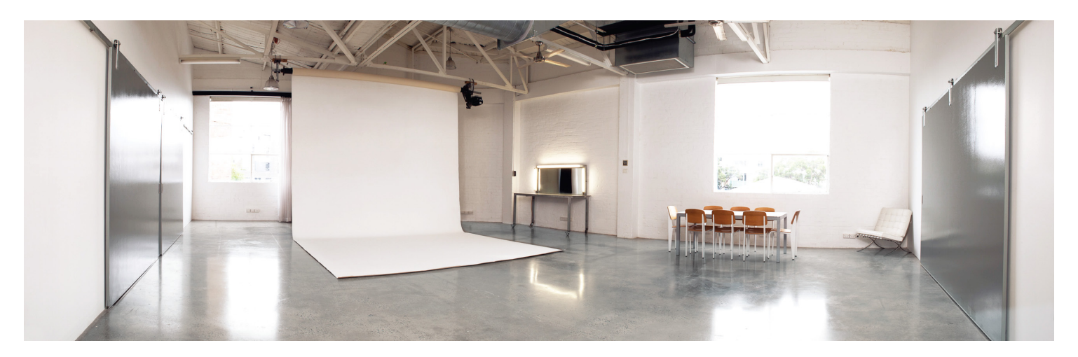
Studio B — 110m²